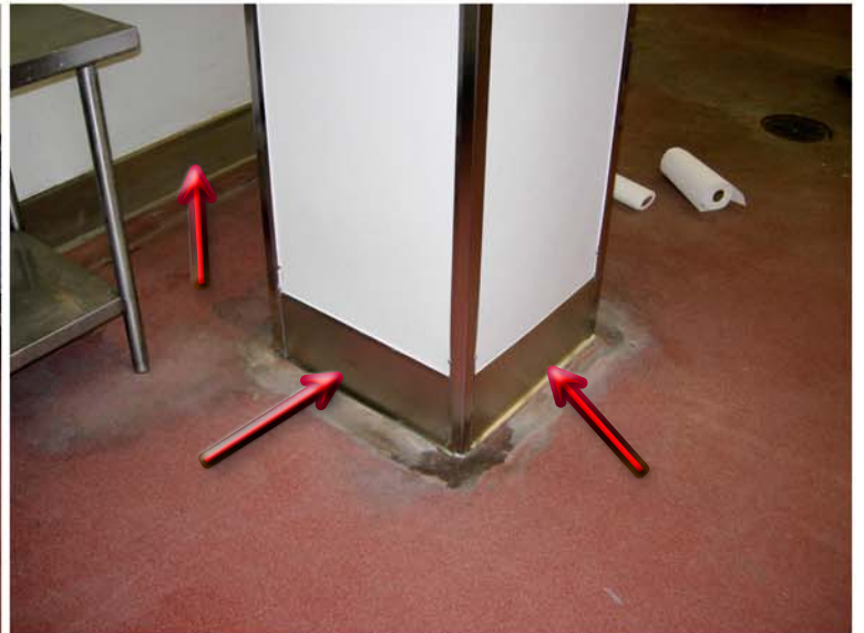
new re-built column