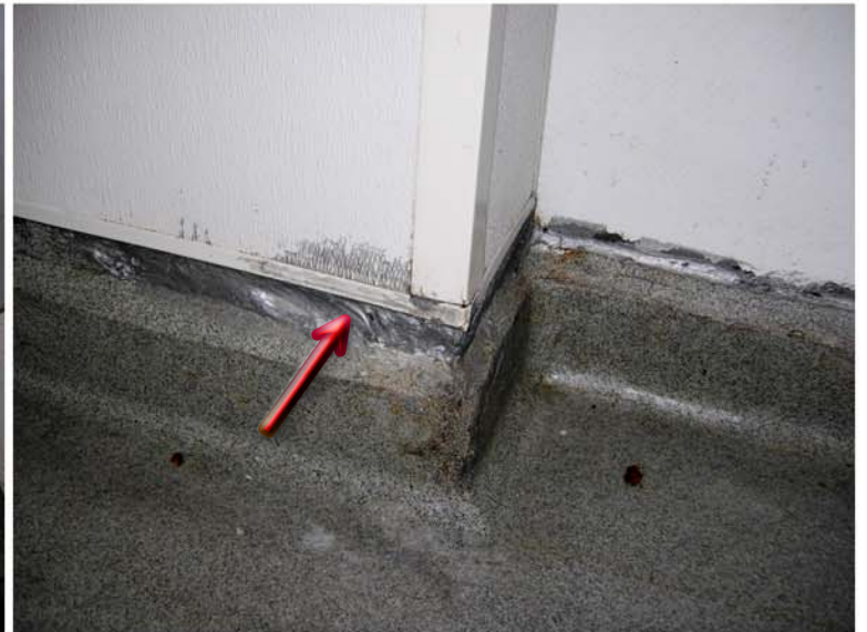
re-caulked with 100% pure silicon caulking