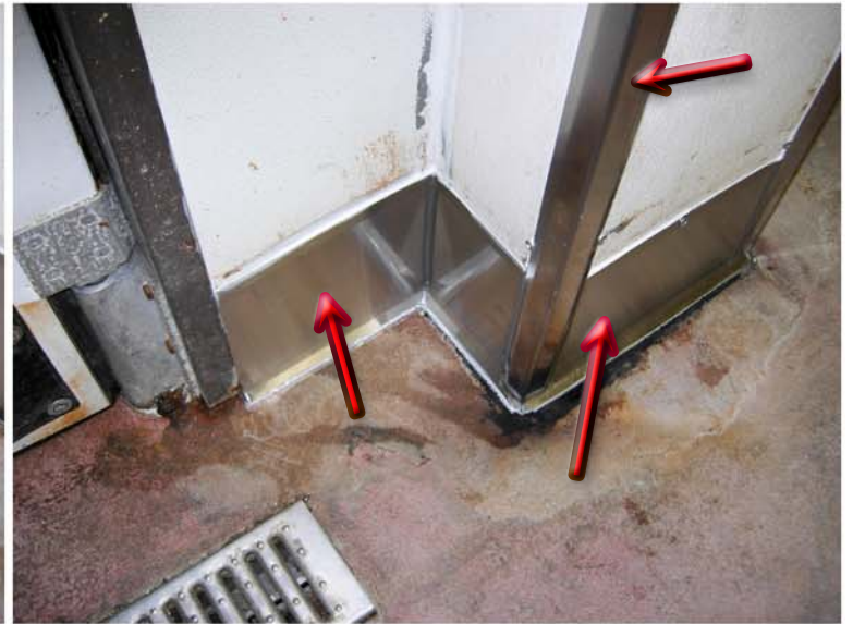
New stainless coving everywhere needed