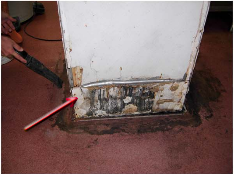
column rotted out needs re-build