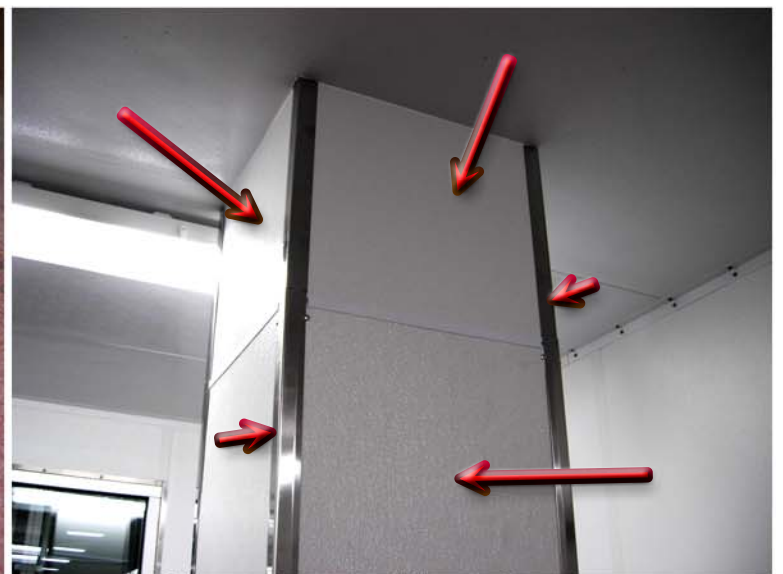
all new wall column