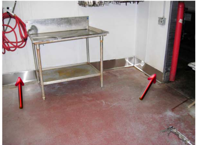
new stainless coving