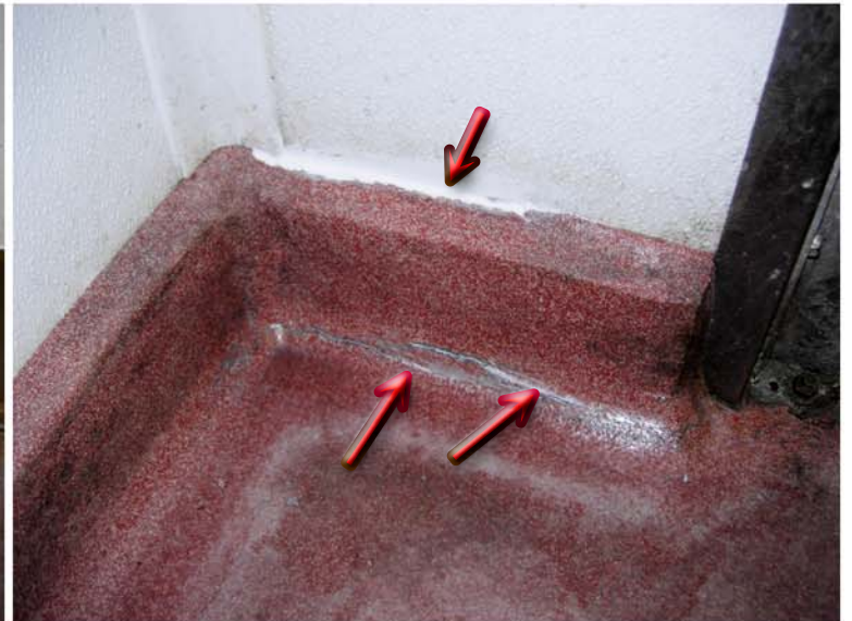
all sinks, walls, coving re-caulked 100% silicon type