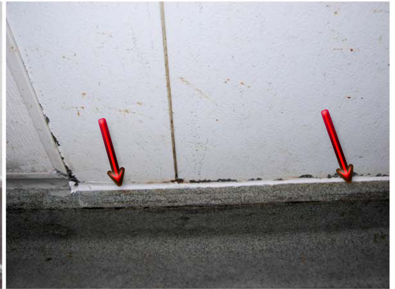
removed all caulking wrong type used