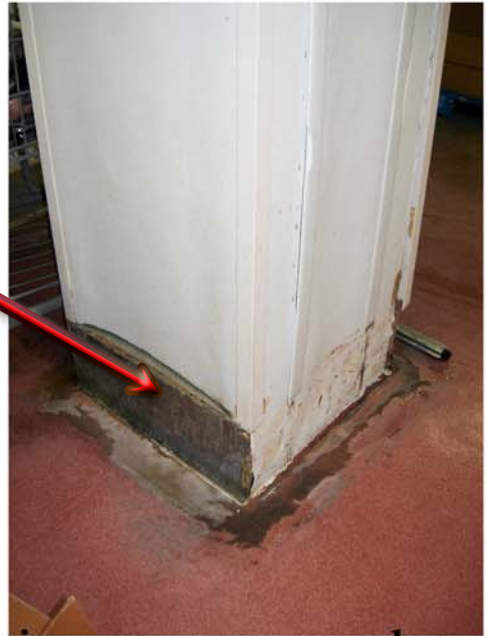
coving missing numerous places