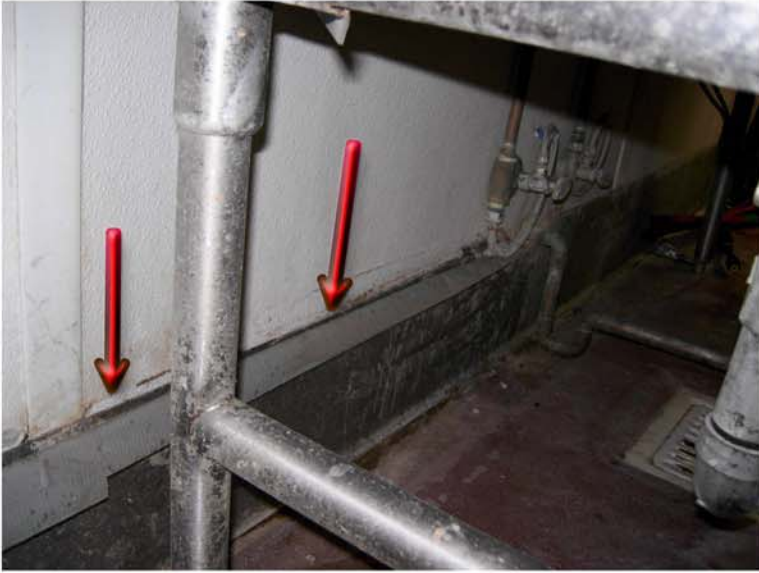
all coving coming loose in meat prep area