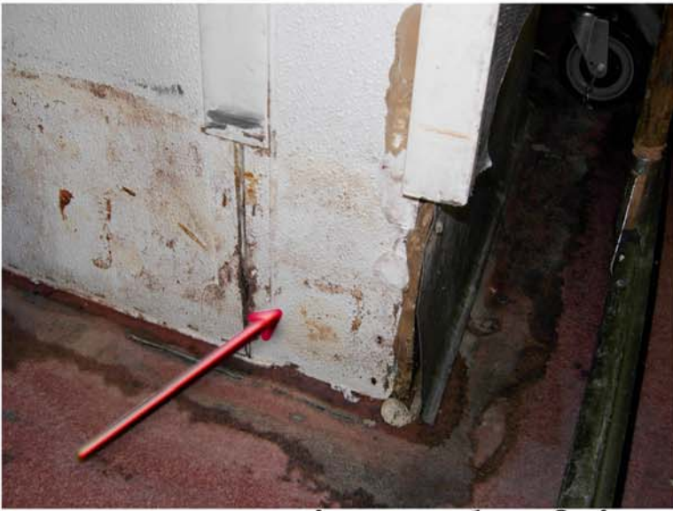
wrong coving made of tin