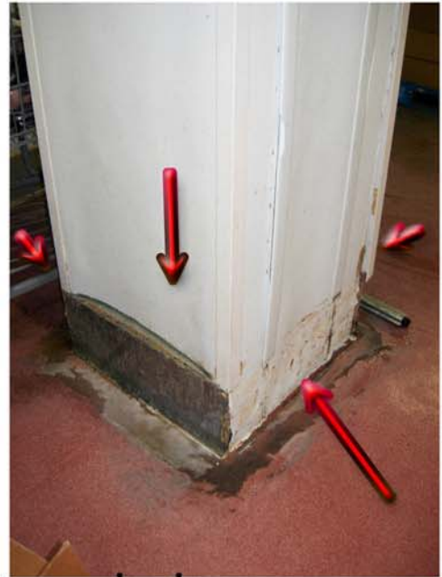
coving missing many spots